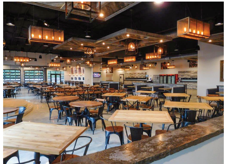
A socially-distant awards presentation was recently held in the new Clayton Cavalier Homes breakroom.