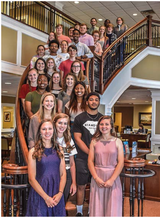
This year's graduating class of the Dale Carnegie Training for Young Adults program.

B ringdley Construction joins community sponsors in funding the Dale Carnegie Training for Young Adults program. The seminar is designed to prepare young adults for the real world, giving them skills to reach their goals and live up to their full potential. The program consists of eight three-hour interactive sessions involving real-life scenarios and role-playing.