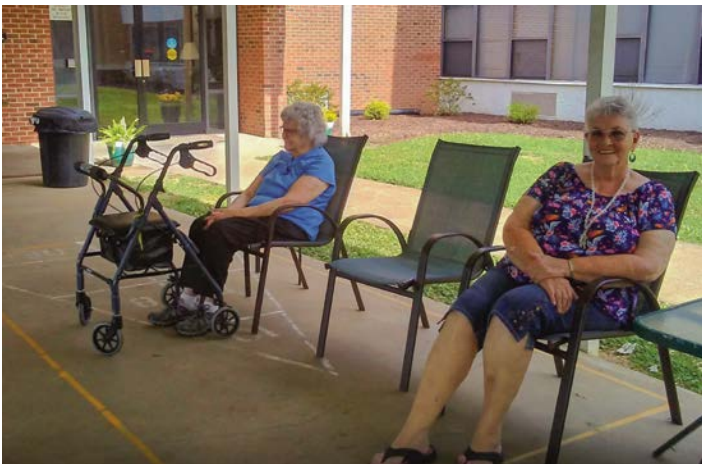
Brindley & Associates not only manages the day-to-day operations of properties like The Lawrenceburg Lions Home, the team also works to ensure the culture serves the residents.