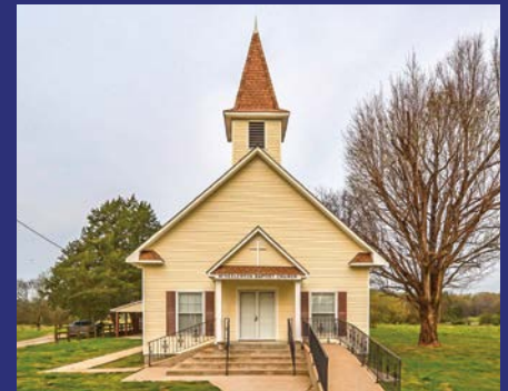
Construction began recently at Wheelerton Baptist Church.

A groundbreaking ceremony was held on April 4, 2019. We are so blessed to be working with the members of Wheelerton Baptist Church and are thankful they have placed their trust in Brindley Construction!