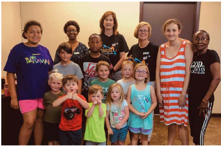
The Giles County Public Library partnered with Pulaski Terrace & Tanglewood Apartments in Pulaski to provide a satellite summer reading program for local children.