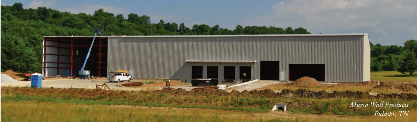
Murco Wall Products Pulaski, TN