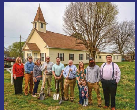
A groundbreaking ceremony was held on April 4, 2019.