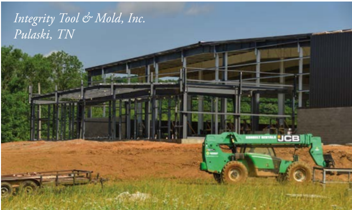
Integrity Tool & Mold, Inc. Pulaski, TN