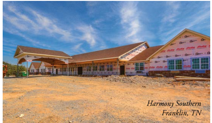
Harmony Southern Franklin, TN