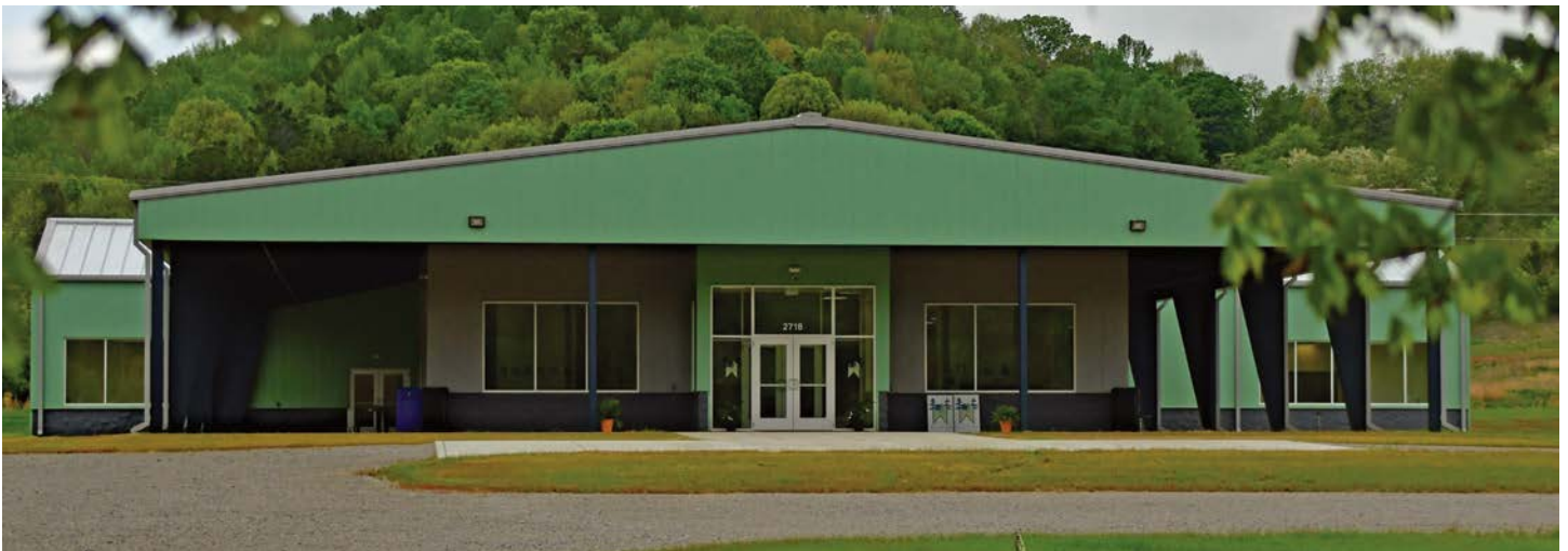
The 13,835-square-foot Education Center features staff offices, classrooms, conference rooms, galleries, a break room, and restrooms.