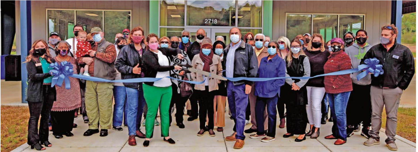
The ribbon cutting ceremony for Wolf Gap's new Education Center was held on April 21st.