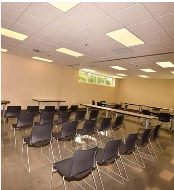
The Center has three large classrooms that are separated by folding partitions that convert into conference space.